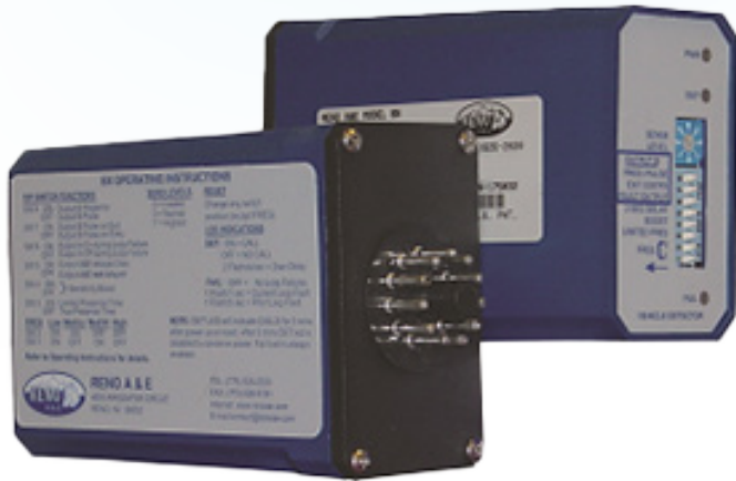
3" High x 1.75" Wide x 4.3" Deep